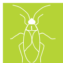
Box Elder Beetle