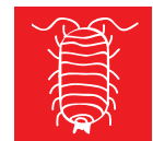
Pill or Sowbug

If a pest is detected (or suspected) in your residence, please call us!